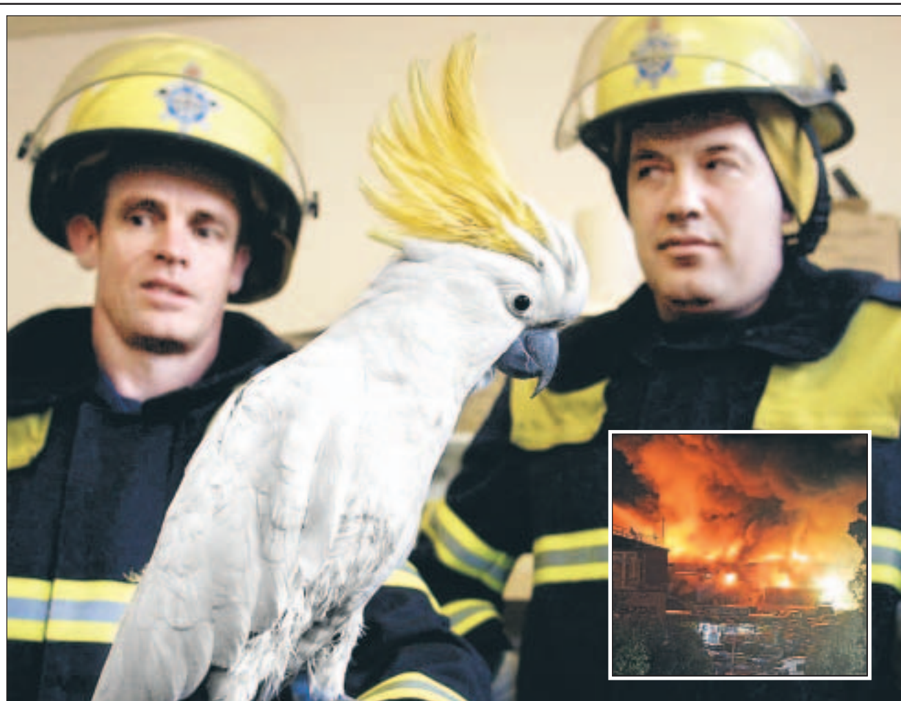
Harry the cockatoo could barely raise a squawk after he was rescued from the $20 million fire that destroyed the Lombard paper warehouse in Flemington yesterday. Report, pictures: Pages 4-5

A POLICE corruption investigator terrorised by bent cops and criminals has refused a $250,000 payout because it would stop him criticising Christine Nixon and the force.