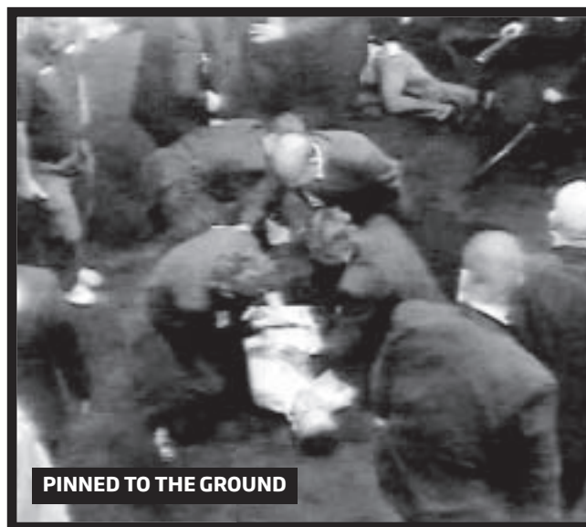
PINNED TO THE GROUND

Two police officers say they were off-duty and having a quiet drink when Crown security guards set upon them ... now they want hundreds of thousands of dollars compensation