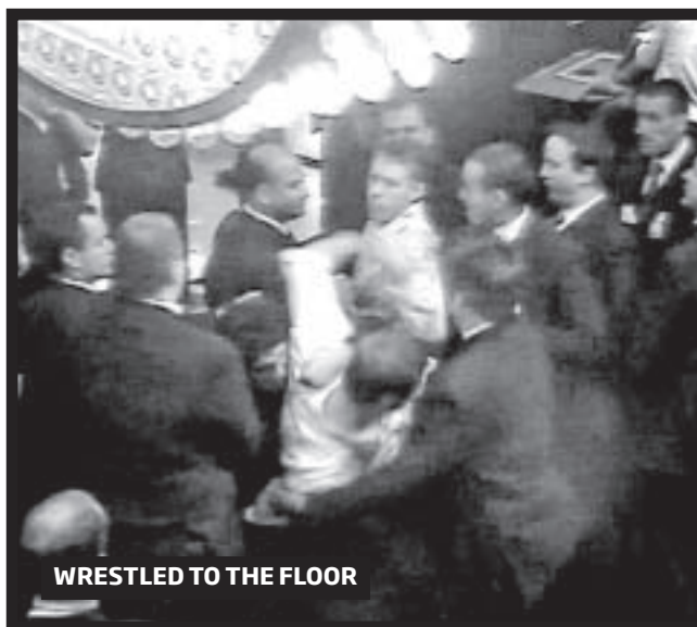
WRESTLED TO THE FLOOR