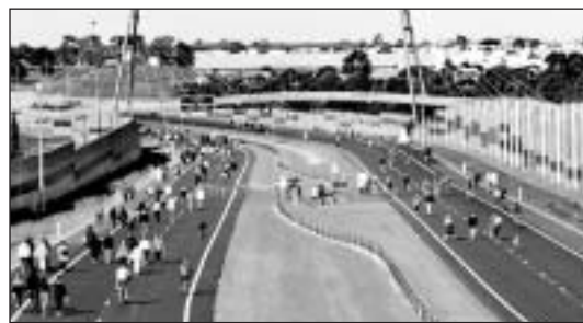
Inspecting: pedestrians walk the bypass.

He said road safety would improve and traffic would reduce.